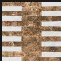
CIATA Duo Gold