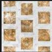
LIPSO Duo Gold